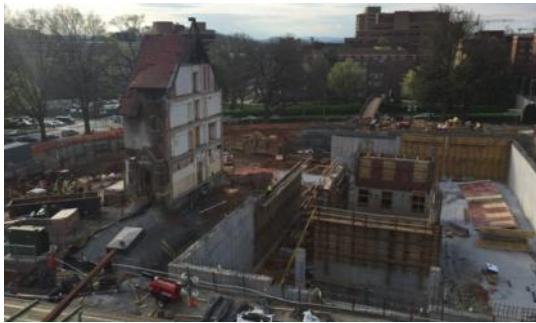
The foundation of the new Strong Hall (March 2015).

bedded limestone. Hazards such as irregular weathering, caves, and sinkholes present challenges with building design and construction. The site has a thick residual clay overburden, with bedrock at depths ranging from 42-75 feet below the surface. NQ coring was performed to evaluate integrity and continuity of the bedrock. The Rock Quality Designation from the cores ranged from 33% (poor) to 90% (good/ excellent). Based on the structural loads of the building and underlying karst geology, the building was designed to be supported on drilled shafts extended into 10 to 15 feet of continuous, competent bedrock. Some of the drilled shafts exceed depths of 100 feet.