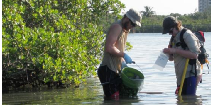
Collection of sediment and the clam Phacoides pectinatus in Fort Pierce, FL.